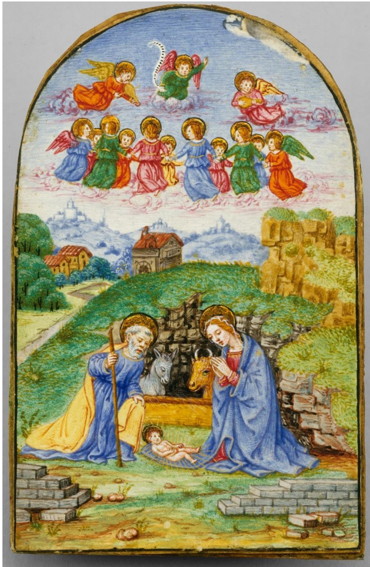
Unknown maker, possibly European 19th century / Pax with a Miniature of the Nativity, c. 1850/1875 / miniature painted on parchment / National Gallery of Art, Washington 1961.9.196