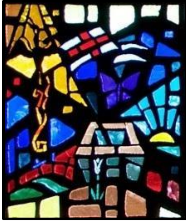
Window: The Resurrection